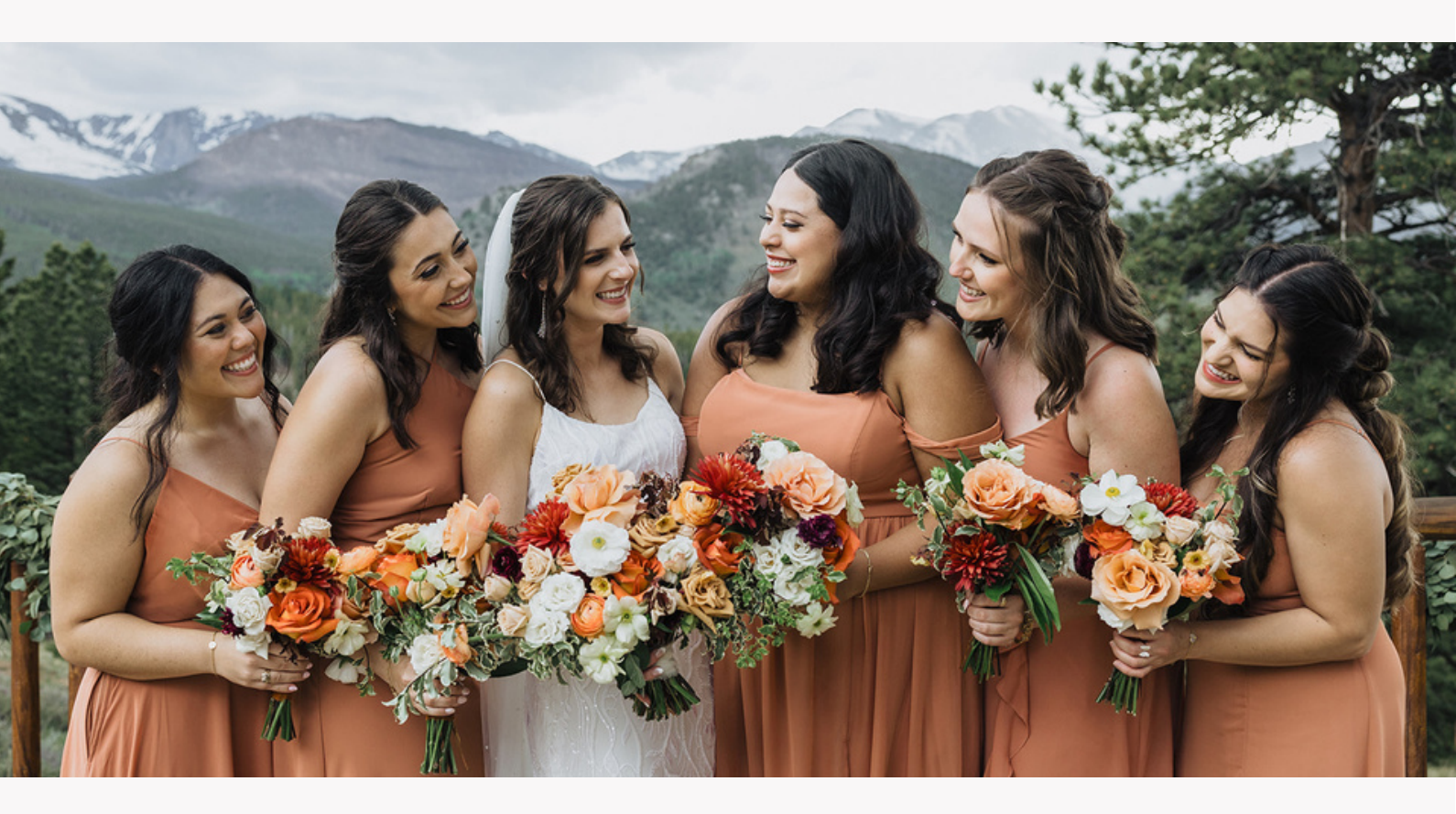
Starting at $3,000

At Weaver Weddings and Events, Day-Of Coordination begins one month out. We like to build relationships with clients and vendors prior to the wedding day, and we refuse to go into your day without all of the details!